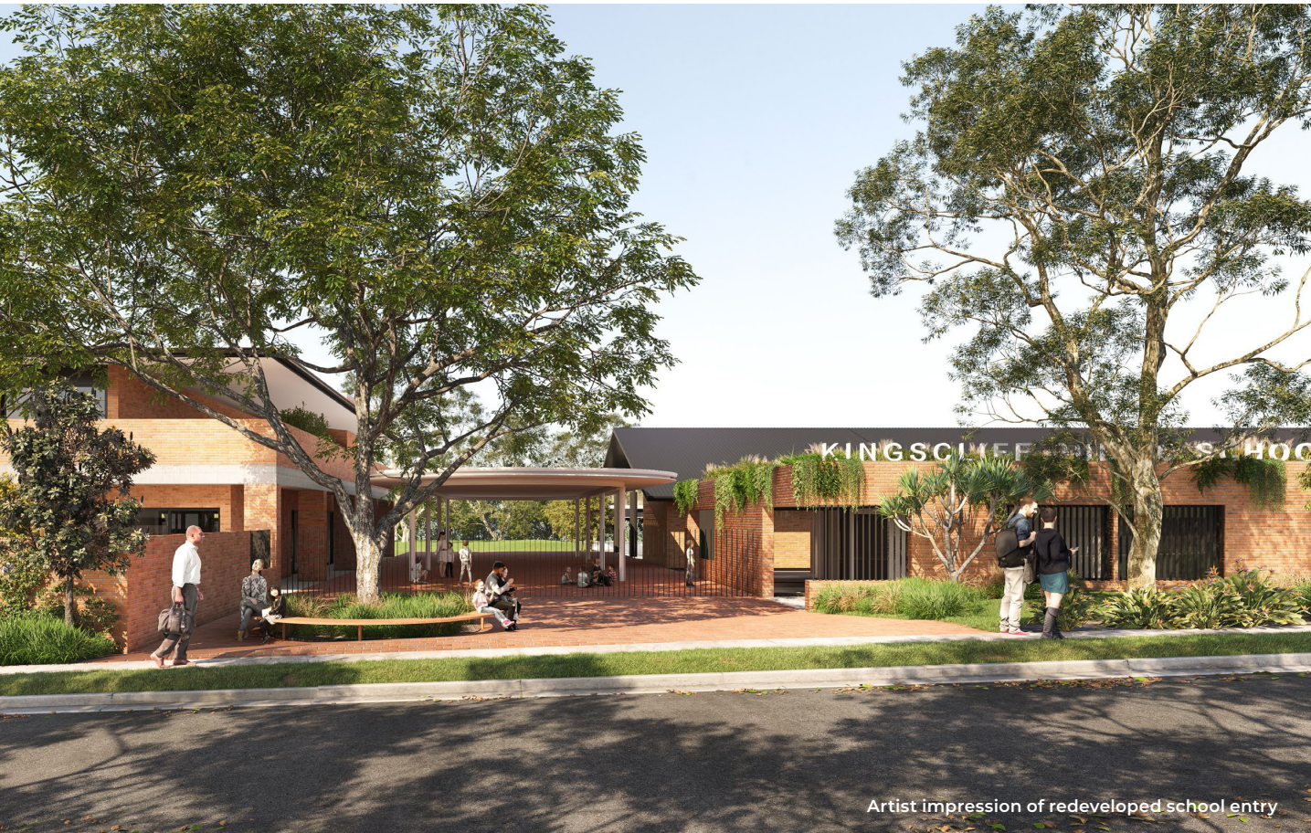
Artist impression of redeveloped school entry