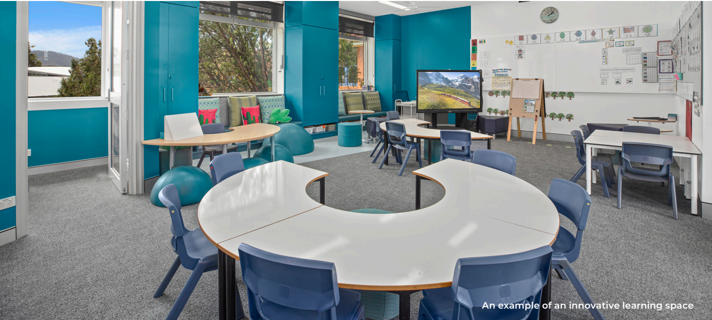
An example of an innovative learning space

All existing classrooms, including demountables, will be demolished and 32 new innovative and flexible learning spaces will be built to facilitate a range of learning modes and activities.