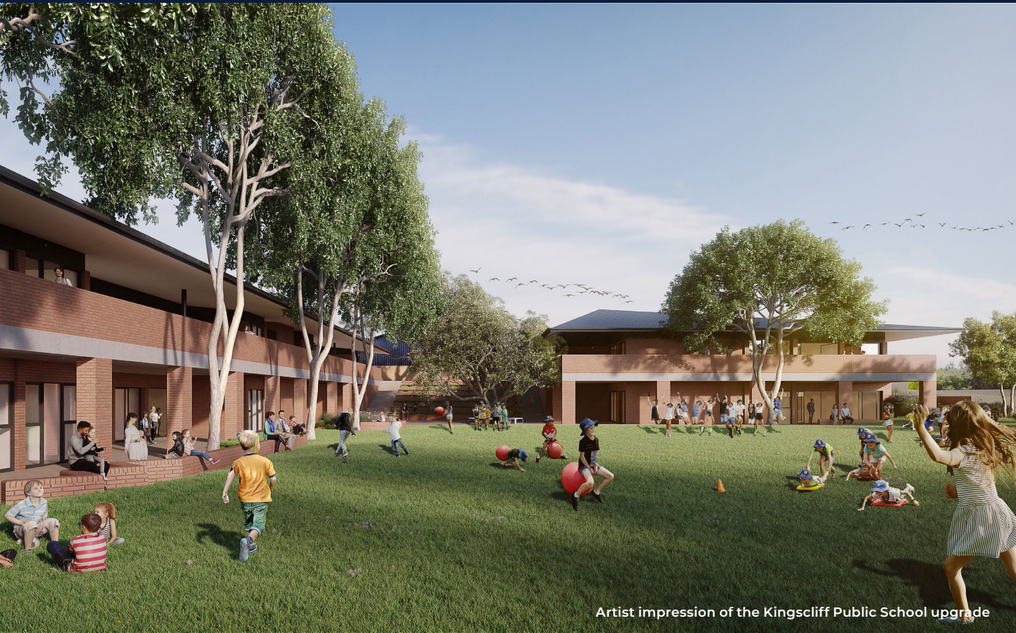
Artist impression of the Kingscliff Public School upgrade

The NSW Government is investing $6.7 billion over four years to deliver more than 190 new and upgraded schools to support communities across NSW. In addition, a record $1.3 billion is being spent on school maintenance over five years. This is the largest investment in public education infrastructure in the history of NSW.