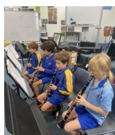
CB Lesson of the Day!