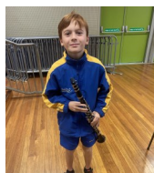
CB band member of the week!