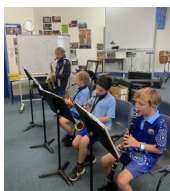
PB lesson of the day!