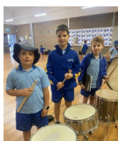
CB section of the week!