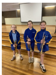
CB Section of the week