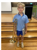
CB member of the week!