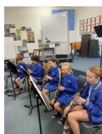
Lesson of the Week!