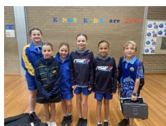
PB section of the day!