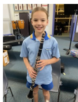
PB Member of the week!