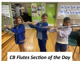
CB Flutes Section of the Day