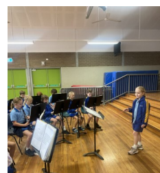
Georgia Conducting warm up!