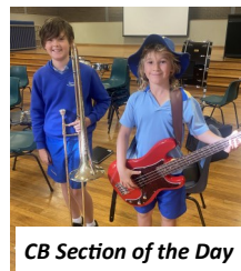
CB Section of the Day