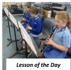
Lesson of the Day