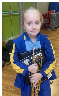
Concert Band Member of the Week