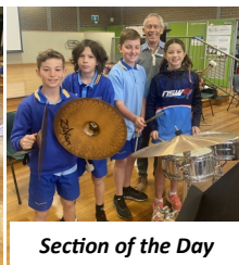
Section of the Day