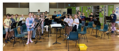
The 2023 KIMP Concert Band