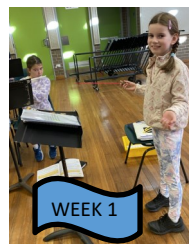
Band Members of the Week!