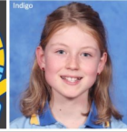
Kingscliff Public School Captains