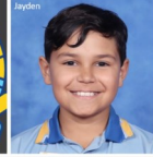
Kingscliff Public School Vice Captains