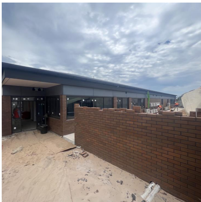
Exterior of Building 2

The façade and external glazing of Building 2, the new administration building, is now complete, and internal fit out and landscaping have commenced. Community consultation to incorporate Aboriginal design into the project is progressing.