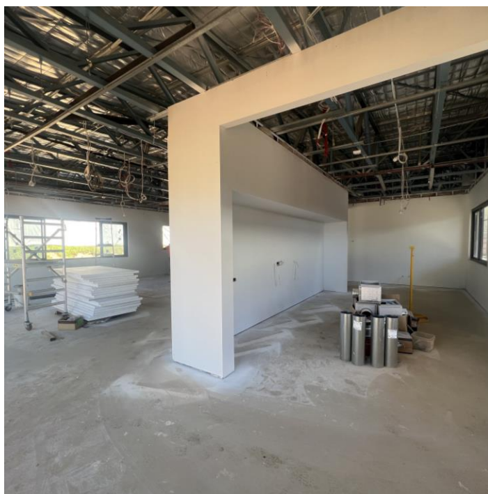
Interior of Building 2