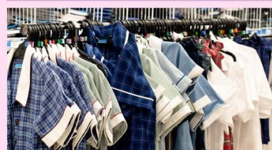
Back to School NSW Vouchers

$150 in vouchers available now for families to spend on school supplies