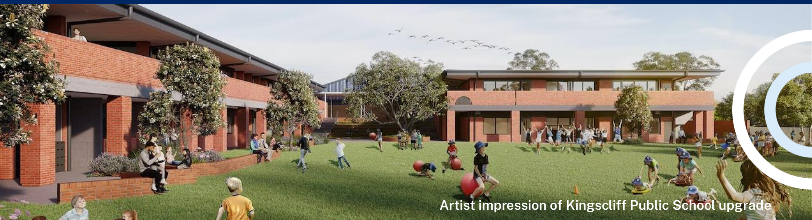
Artist impression of Kingscliff Public School upgrade