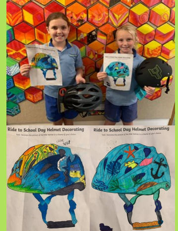
Ride to School Day Helmet Decorating