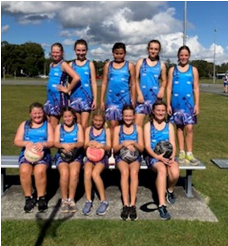
Girls 2019 Netball Team